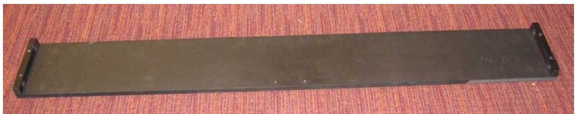
Figures 7 and 8:

TIP: Use the threaded holes towards the back of the Wings and set the smooth side of the Cross Member facing the Foot Board. The 2 threaded holes in the Cross Member MUST be on the BOTTOM.